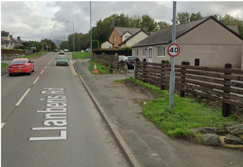
Mis Hydref 2021