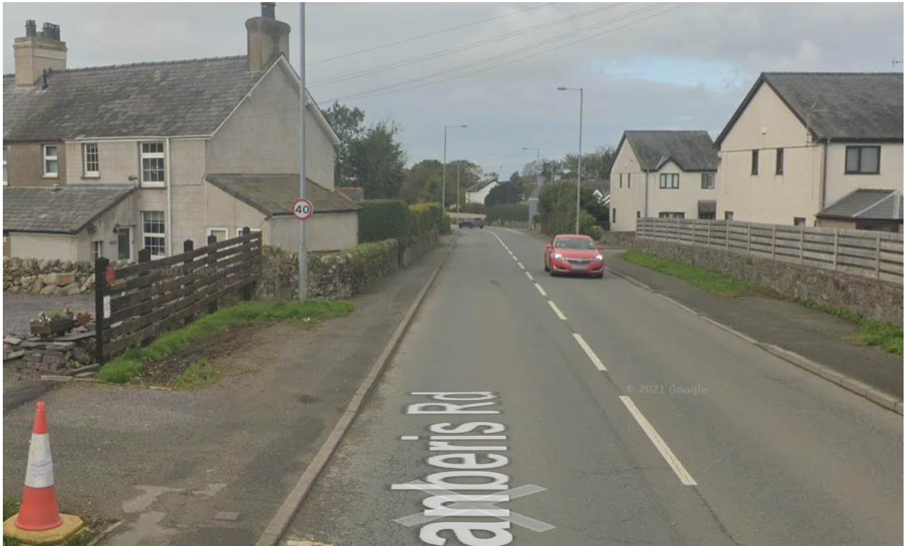
Lluniau o Google Street view Mis Hydref 2021